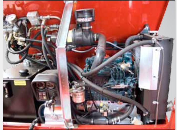
Water cooled 3-cylinder Kubota diesel engine