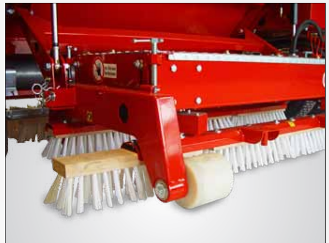
Brush unit for straightening and evening out the pile and brushing in the filling