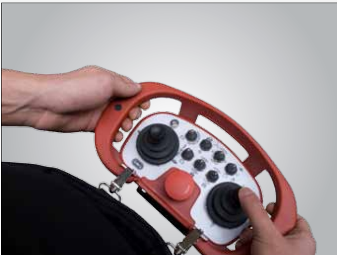
Remote control with 100 m range