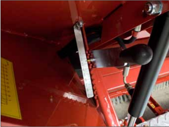
Material output exact adjustable through a slide valve